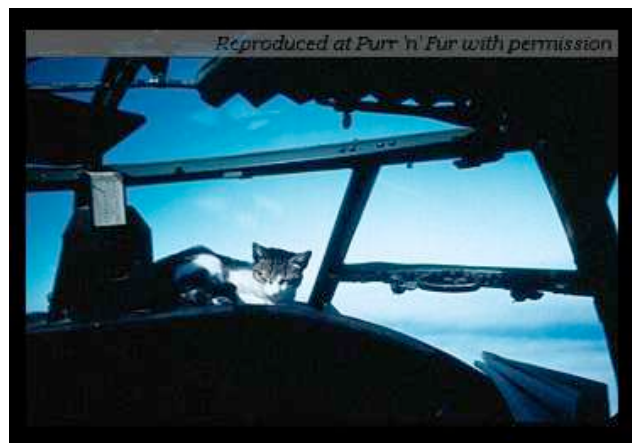
A cat resting (possibly sleeping!) during a battle in the cockpit of an American B-25 Mitchell bomber.