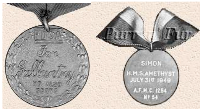
Dickin Medal awarded to the Able

"Served on HMS Amethyst during the Yangtze Incident, disposing of many rats though wounded by shell blast. Throughout the incident his behaviour was of the highest order, although the blast was capable of making a hole over a foot in diameter in a steel plate."