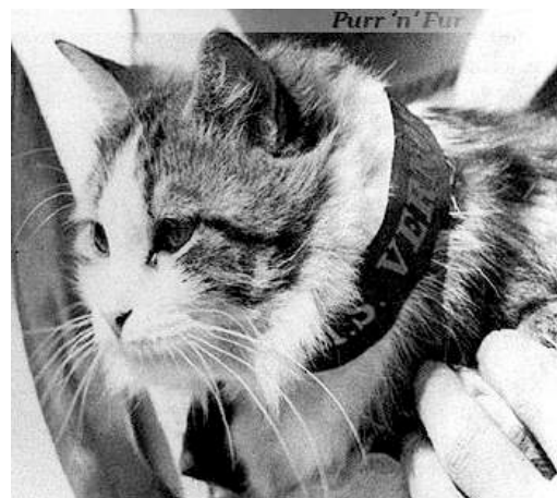
Anonymous seacat from HMS Vernon dutifully wearing his/her collar.

Ship's cat were so widely used and so officially regarded as part of the crew during World War II that Lords Commissioners of the Admiralty has even ordered 'all cats in naval establishments must wear collars at all times'. The collars were to have the ship's name embroidered on them in order to enforce have some sense of military discipline to the feline member in the Navy. However, everyone who lives with a cat knows how difficult it is to put things on them if they are unwilling, the order was slowly forgotten. 28