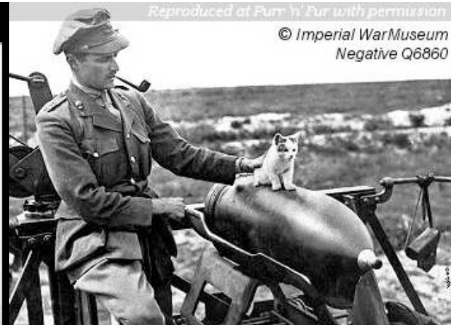
An officer of 444 Siege Battery, Royal Garrison Artillery, smoking a pipe as he supervises a kitten balancing on a 12-inch gun shell near Arras, France, July 1918. Further information stated that the kitten originally lived in the German trench and later on joined the British trench as official mascot.