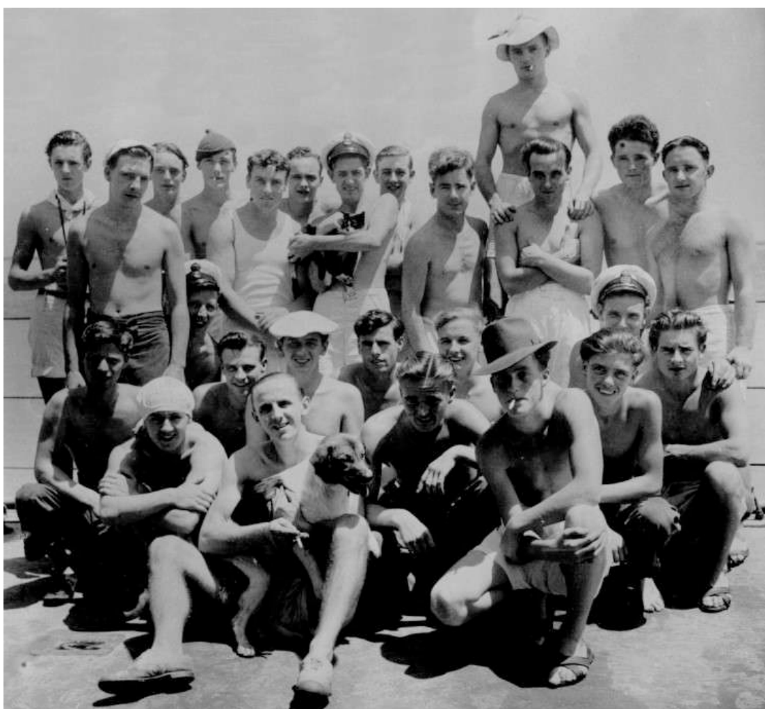
July 17, 1949: Crewmen of HMS Amethyst F-116 seen while trapped on Rose Island during the Yangtze Incident. Simon brought smiles on seamen's face even in such dreadful situation