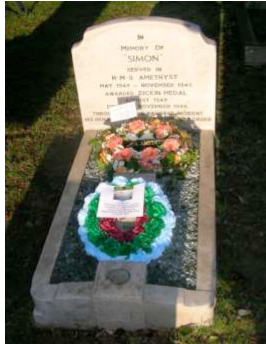
Headstone for the Able Seacat Simon, D.M. at the PDSA Animal Cemetery

Across the Atlantic, the services provided by our feline friends were also being taken very seriously. Pooli served aboard a United States attack transport during World War II. A veteran who rates three service ribbons and four battle stars. 27