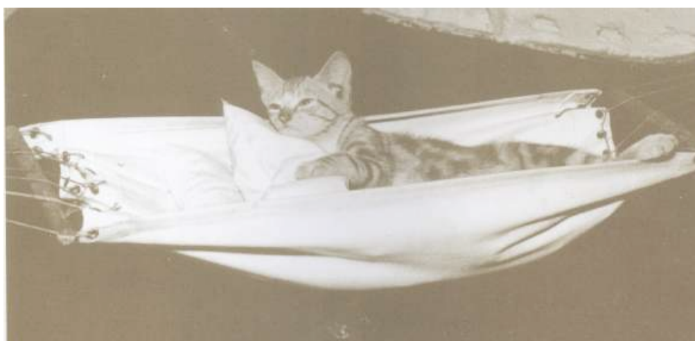
Anonymous seecat of HMS Eagle stretches out in the hammock and with his/her pillows.