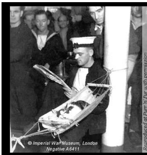
Seecat Convoy of HMS Hermione resting with his fellows seamen.

Sailors took all these contributions very seriously. Some ships might even have more than one cat. In this case, the cats were able to 'rise through the ranks' as human do. From becoming the mascot of a particular part of the ship, they could ultimately go on to become the official mascot of the whole vessel. It has also become a convention for seacats to have their own kit, including their own proper hammocks and were listed on the ship's book. 12 Some of them might even get just as much gear as their human counterpart! Seecat Thomas Oscar who served on HMS Scorpion , was reported to have his own hammock completed with mattress, blankets and pillow, he also has his own kitbag, an HMS cap ribbon that he wore round his neck on Sundays and a rabbit-tail toy. 13