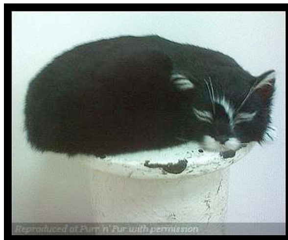
A replica of the Able Seacat Simon, D.M. – a memorial at the Sea Cadet Corps unit of Welwyn Garden City and Hatfield in England. 41