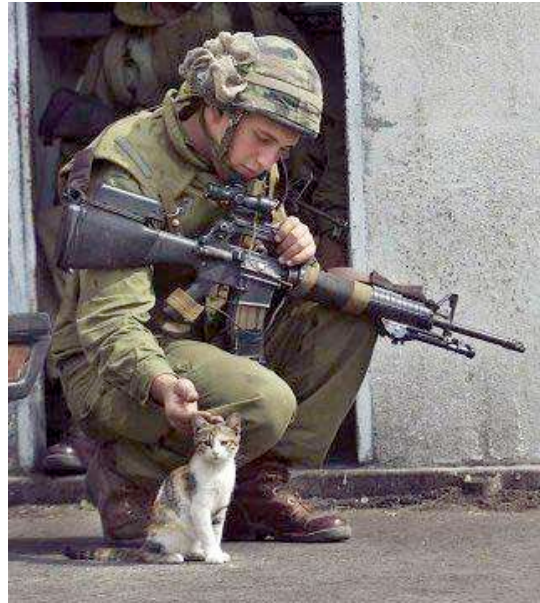
An Israeli soldier gave this kitten a quick pet during a short break from combat. 40

In the meantime, I would like to dedicate this essay to all cats who served in all armed force around the world, who choose to stay with us.