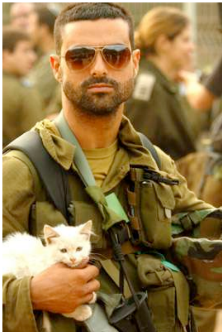
This Israeli soldier saved this kitten in the village of Kauzer during a mission in Lebanon, the first thing the cat and its new owner did after having crossed the border into Israeli was to share a military canned meat. The cat is now named Kauzer. 38