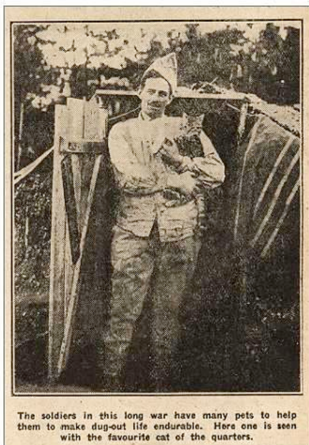
The soldiers in this long war have many pets to help them to make dug-out life endurable. Here one is seen with the favourite cat of the quarters.

Since the keeping of cats during this war was rather informal, it is difficult to trace the management and the welfare of the cat soldiers during that time. However, photos and documents proved that cats have indeed served in World War I.