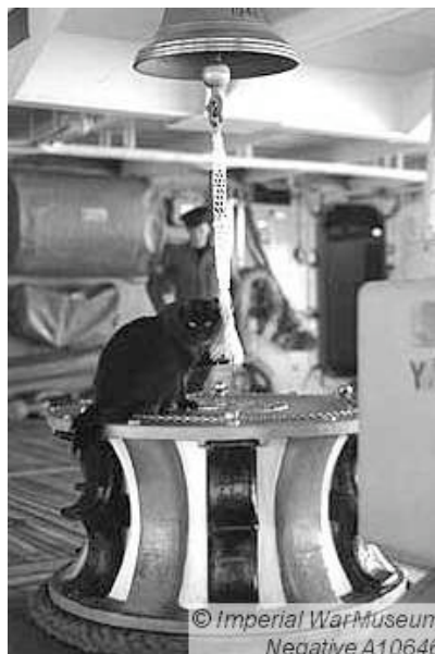
Seacat Tiddle of HMS Argus and HMS Hermione with his favourite station on the ship where he enjoyed playing with the bell rope.

Tiddle was a true sea-cat. He has spent his whole life sailing on aircraft carriers, not many human counterparts can say as much. He was often seen at his favourite station, on the after capstan, where he would play with the bell-rope. He eventually travelled over 30,000 miles during his time in service. 14