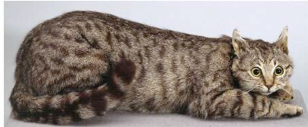
Stuffed tabby cat 'Crimean Tom'