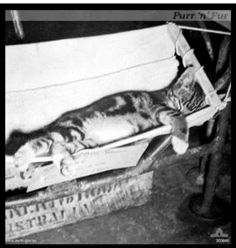
Anonymous seecat of HMAS Kanimbla relaxing after his 'rounds'.