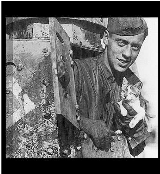
A kitten is held by a WWI soldier in a tank.