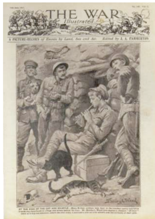
The cover of The War Illustrated showing the pets the soldiers adopted from the trenches.